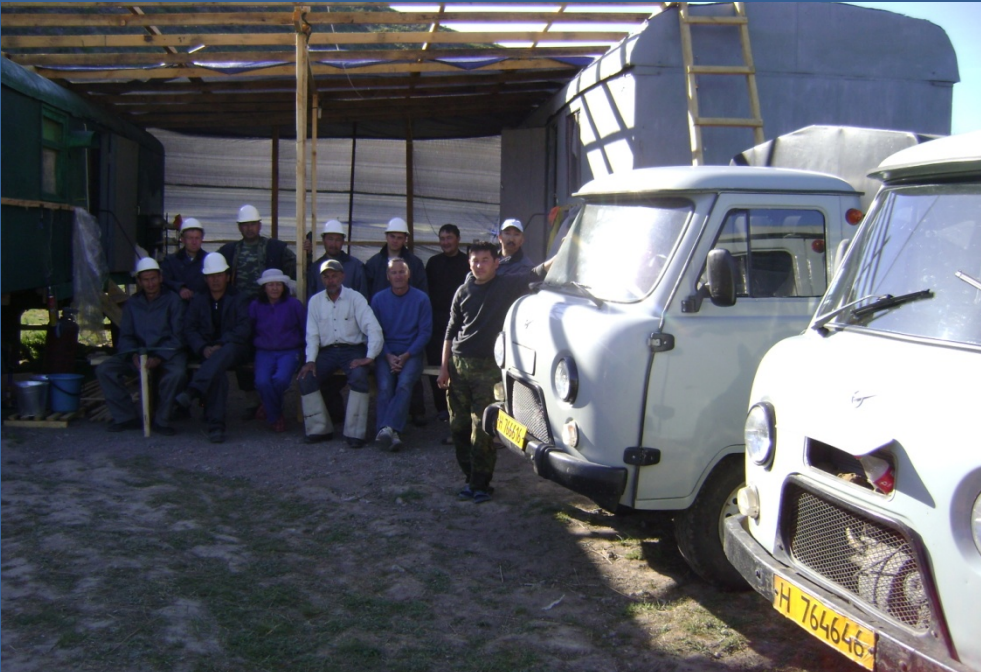
Bizhe regional exploration